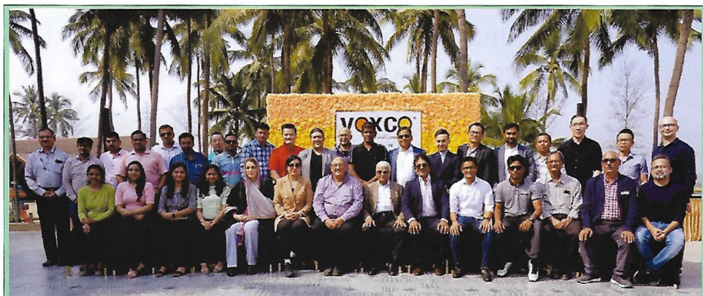
The VOXCO family

On the second day, all the guests were taken for a visit to VOXCO R&D Application Lab/Practical Testing of Pigments (Coating, Plastic & Ink), and hands on training was given for paint production and all its other aspects.