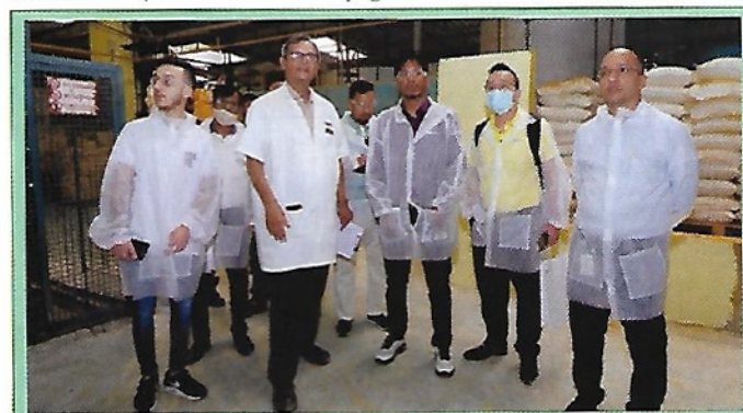
The Guests on the factory tour

Delving deep in to the global pigment industry, he traced historically the global growth and shift in the pigment production trends. He also gave a glimpse into the future trends in the focus, chemistries and pigments.