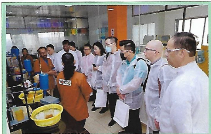
Practical on hands training